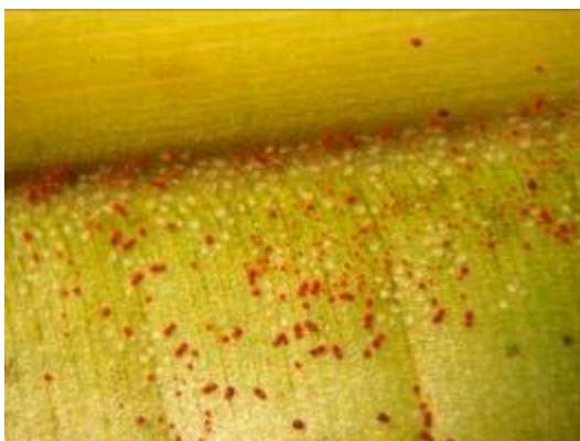
Figure 3 Large red palm mite colony on heliconia

For more information contact Juliet Goldsmith 983-2281/2267