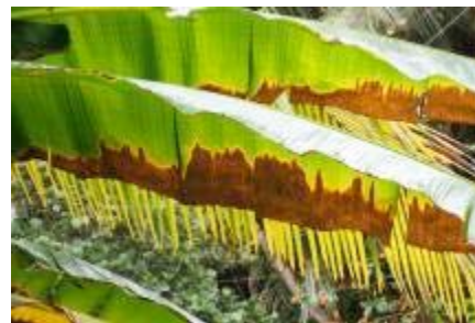
Figure 5 Red palm mite damage on banana leaves.

The Red Palm Mite could be an economic threat to the coconut, banana and ornamental plants industries.