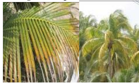
Figure 4 Red palm mite damage on coconut palm