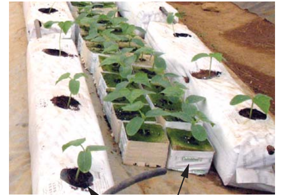
Figure 3. Coir and glass wool growing materials

Growing Medium: Greenhouse production can be carried out on marginal lands as plants can be grown in containers (pots, bags) with or without soil. Some materials used include coir, rock wool, vermiculite (Fig. 3). Hydroponics is also practiced in greenhouses.