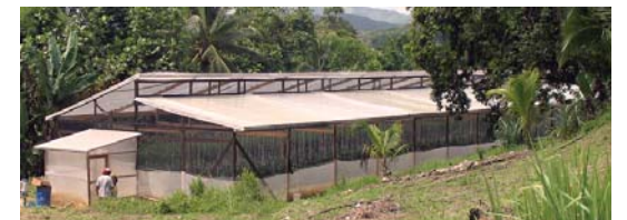
Figure 4. RADA-constructed greenhouse, Highgate St. Mary

To date RADA has constructed two green houses in collaboration with two farmers' groups, in Highgate, St. Mary (Fig. 4) and Chester Castle, Hanover (Fig 5). Units are 600 m 2 (0.15 Ac) in size and covered with clear plastic and mesh.