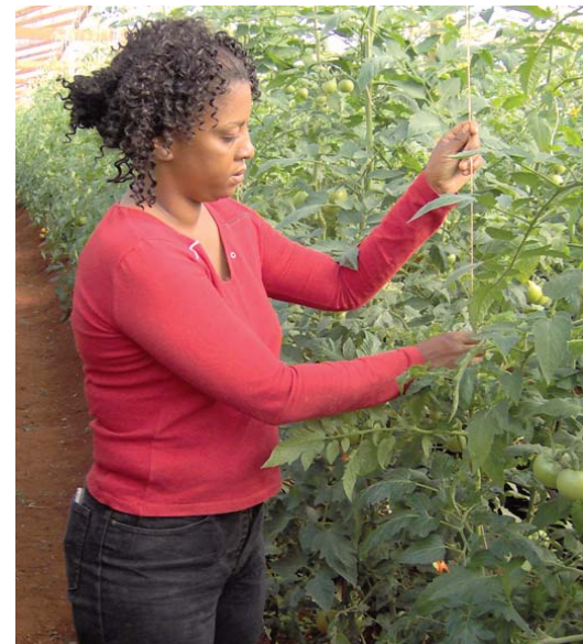
Figure 2. Comfortable work environment

The working environment inside greenhouses is much more hygienic than outdoors. This enhances productivity as well as worker comfort (Fig. 2), outside of producing excess heat