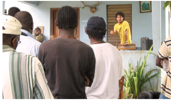
Figure 7. DFCPMP Farmer & staff training

RADA has also assisted with irrigation, marketing information, construction and training with three other green houses in Douglas Castle and Clarendon in St. Ann. Training is also been conducted with the Greenhouse Growers Association.