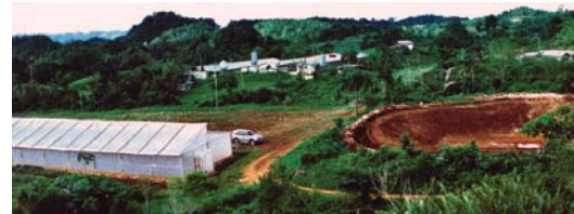
Figure 8. Greenhouse water catchment in upland Jamaica

Challenges: Notwithstanding these huge benefits, several challenges exist. Ecological, physical and socio-economic conditions in Jamaica call for modifications to this introduced technology being used currently. For example, the constant water supply required for greenhouse horticulture to