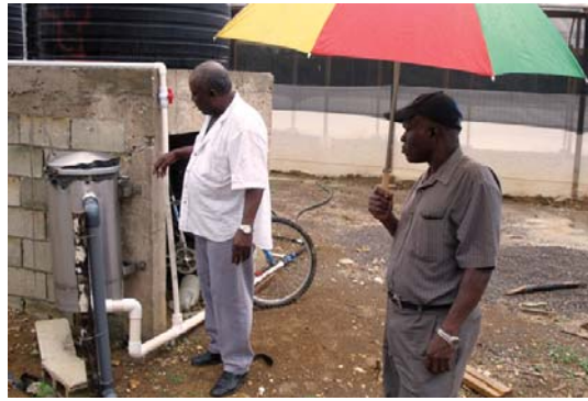
Figure 5 RADA Director and Technician inspecting irrigation system, Chester Castle, Hanover

The Highgate unit is already producing crops of tomato and sweet peppers (Fig. 6), while seedlings are being grown to be planted at Chester Castle.