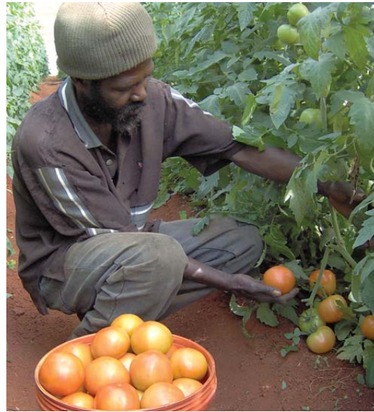
Figure 1 High yielding greenhouse tomato

Quality: Crops from green houses are protected from pests, diseases and other hazards that affect open field crops. The need for pesticides is also reduced, which lowers costs and risk of harmful residues on the crop. As a result of this, higher quality produce is possible (Fig. 1). For consistent quality, good agricultural practices such as optimal plant population, irrigation, plant nutrition and vigilant crop protection (must still be maintained).